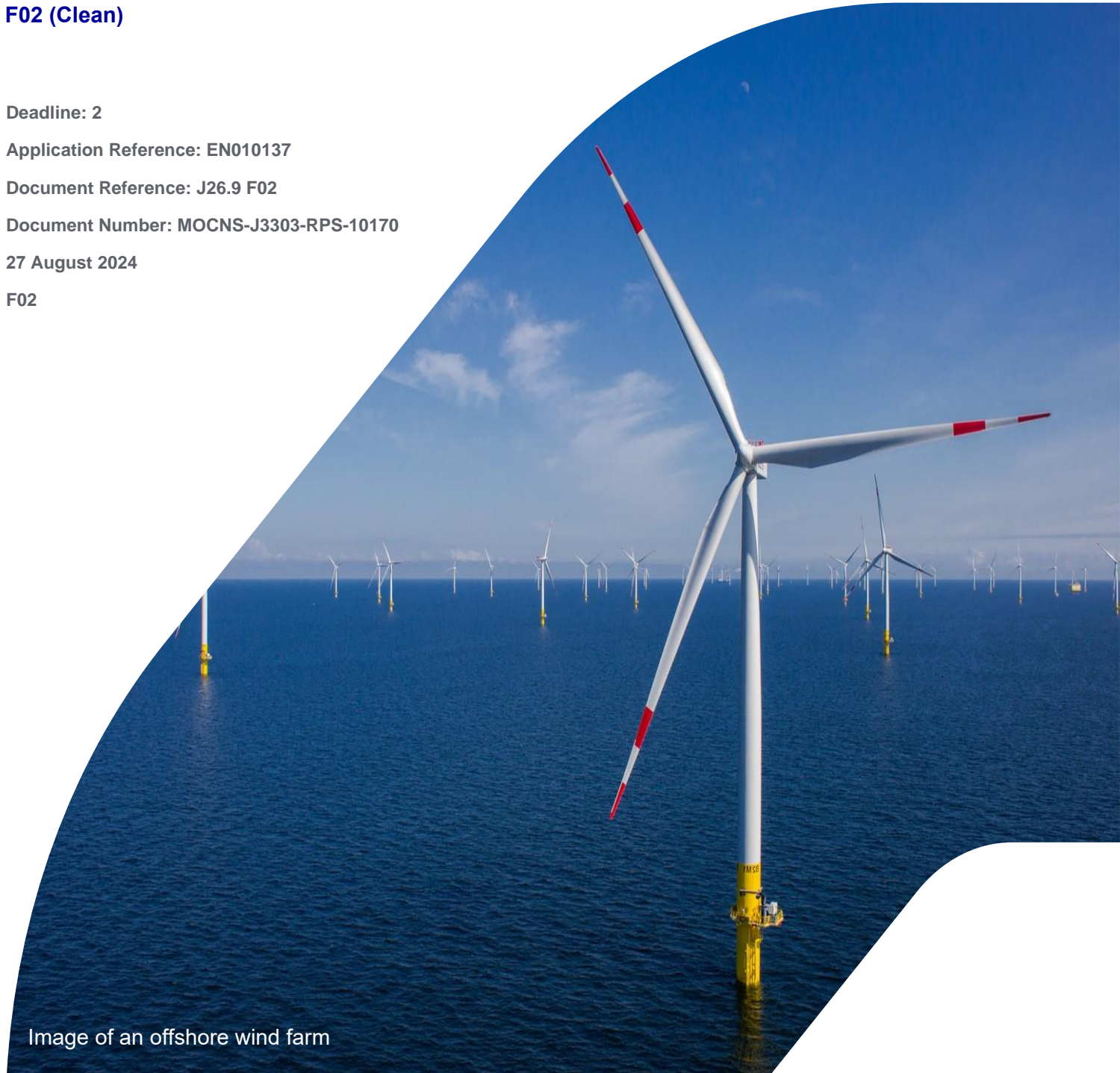
Image of an offshore wind farm